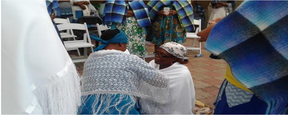
Picture 2: A woman dressing a mother of the groom to be with a shawl at Phakalane.

The narrator was reciting the following words as she was dressing her; -