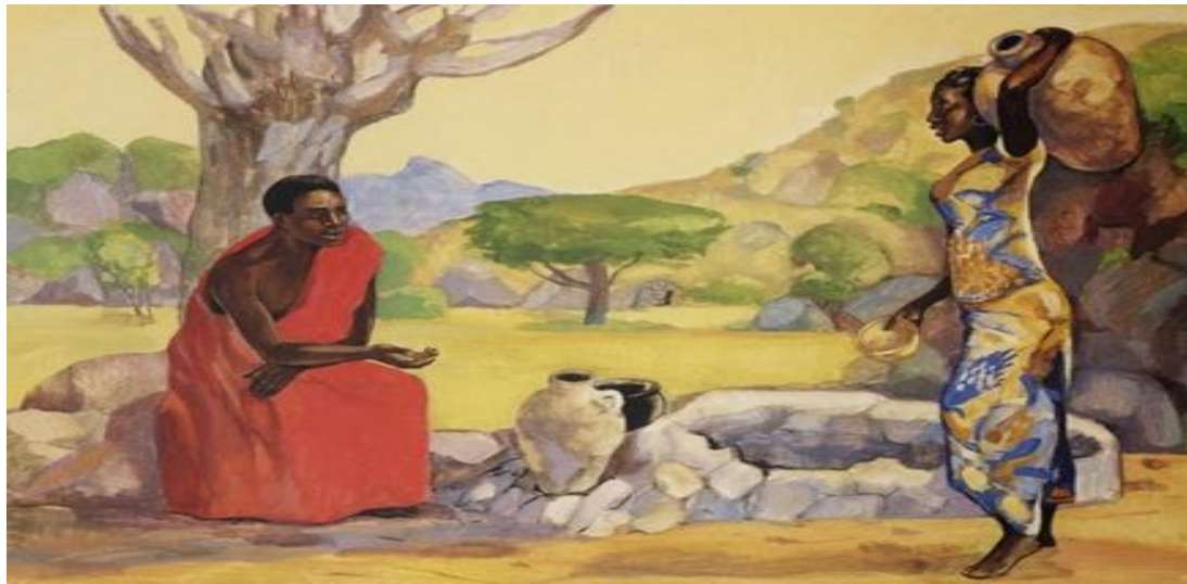
Figure 1: John 4: 16-18