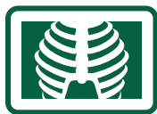
BIOLOGY ANATOMAGE TABLE Selby Auditorium